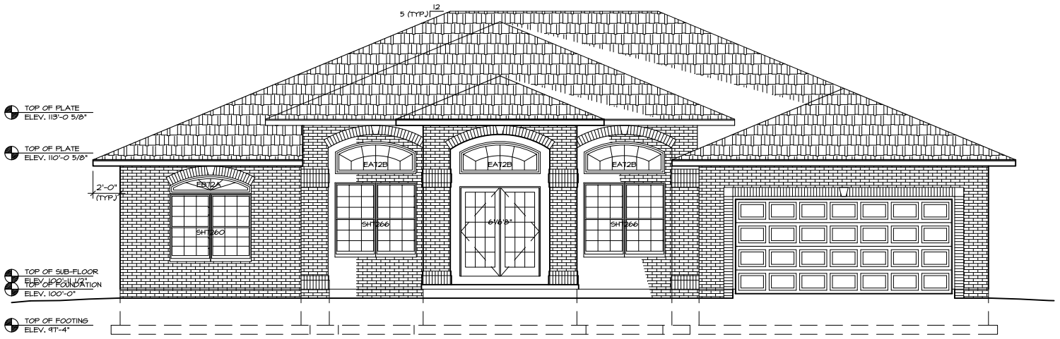
1 NORTH ELEVATION A-1